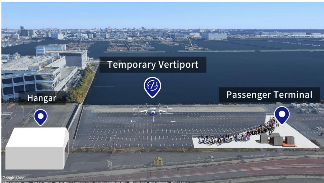
Bird's eye rendering of the event venue

*This image combines photography with rendered elements. The actual layout of the event venue and surroundings may differ.